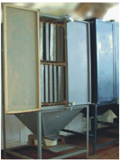
Fig. 5. Box intended for the birth

At the beginning of the departure of the imago from the grain, the cassettes were closed with lids and installed vertically in the box (Fig. 5).