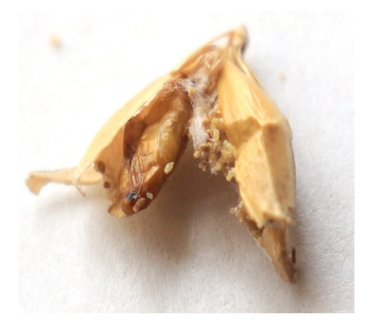
Fig. 4. Cut barley grain with a grain moth pupa

At the beginning of the departure of the imago from the grain, the cassettes were closed with lids and installed vertically in the box (Fig. 5).