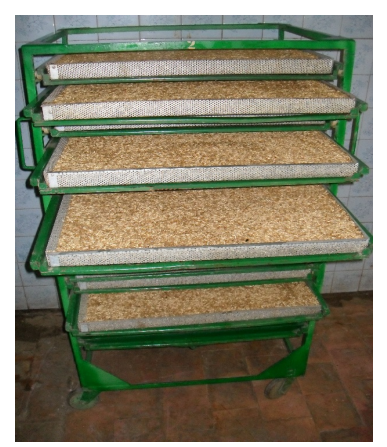
Fig. 3. Rack for grain

The viability of the caterpillars was determined by the percentage of the infected barley grains, selecting four replicates of 100 grains each on the 20th day after infection and analysing them (by cutting the grains). To determine the mass of pupae, the grains were cut after the first butterflies began to fly out of the grain (Fig. 4). All the other indicators were determined by generally accepted methods.